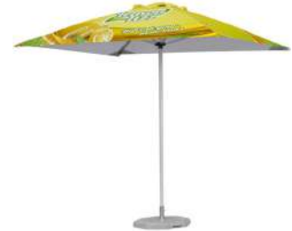
BRANDED ALUMINIUM PARASOL * FULL COLOUR PRINT * SYSTEM * CARRY BAG