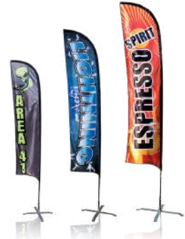
CURVED BANNERS (2 SET) * FULL COLOUR PRINT * SYSTEM * GROUND SPIKES * CARRY BAG