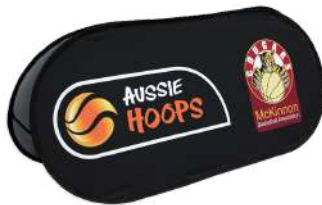
POP-UP BANNER * FULL COLOUR PRINT * SYSTEM * 2 TENT SPIKE * CARRY BAG