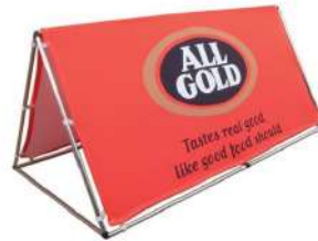
A FRAME BANNER(PVC) * 2X FULL COLOUR PRINTS * SYSTEM * CARRY BAG