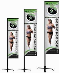
TELESCOPIC BANNERS (2 SET) * FULL COLOUR PRINT * SYSTEM * GROUND SPIKES * CARRY BAG