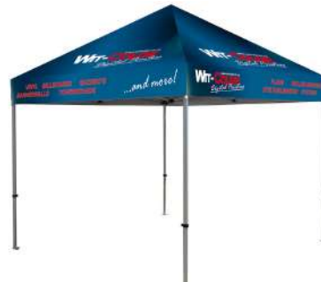
BRANDED GAZEBO * FULL COLOUR PRINT * SYSTEM * CARRY BAG * TOOLKIT