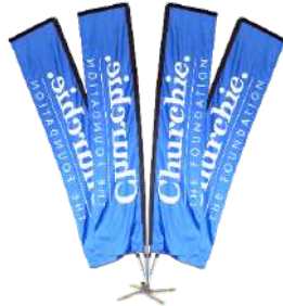
CLUSTER BASE FLAGS * 4X FULL COLOUR PRINT * TWO MOCKUP DESIGNS OPTIONS