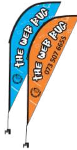
SHARK FIN BANNERS (2 SET) * FULL COLOUR PRINT * SYSTEM * GROUND SPIKES * CARRY BAG